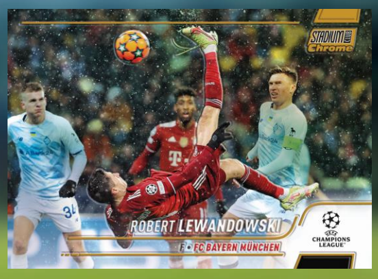
Base Card - Gold Refractor Parallel